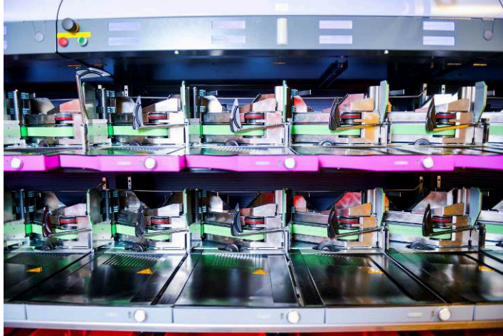
Ergonomics.jpg: A big advantage of the Simex Letter are the easily accessible output compartments.