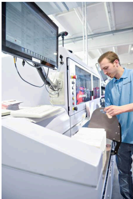
Handling.jpg: The simple handling of the Simex Letter inspires the machine operators.